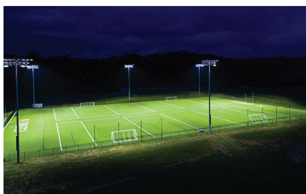
An example of Edgewood’s proposed lighting system installed at Clemson Field

1. Lighting: The amended plan includes the incorporation of the latest LED lighting technology that will minimize glow, light spill and glare. This new technology, along with the height of the poles in our plans, will ensure that lighting from the limited number of night games will not go beyond our property. The plan meets and even exceeds the City lighting requirements.